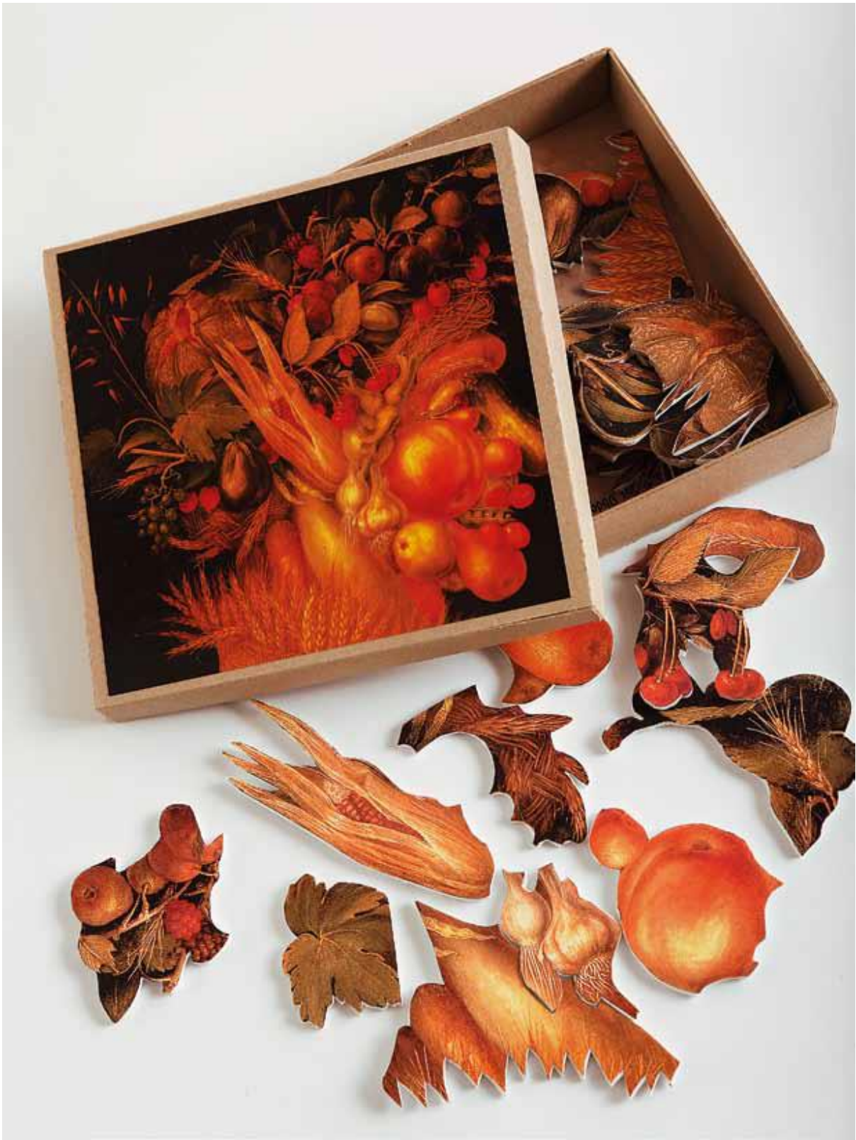
Animation - Gallery Educational Programmes